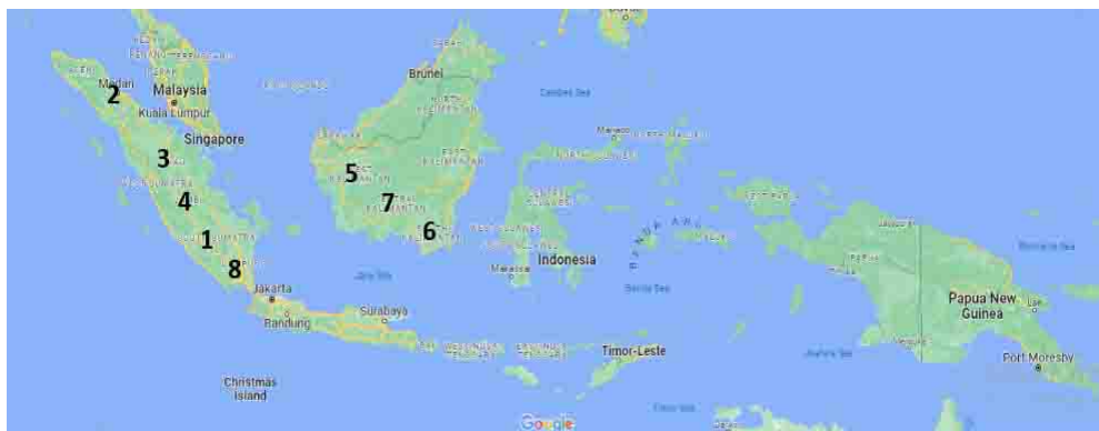
Figure 1. Distribution of provinces as natural rubber producers in Indonesia

The table showed that among some of the largest rubber producers in the world besides Indonesia, three of them are ASEAN member countries namely Thailand and Vietnam. The data shows that the Natural Rubber Commodity is a very dominant product in these countries, making ASEAN a region with tight competition related to the production of these commodities [4]. In Indonesia, it can be seen that the areas that produce Natural Rubber are scattered in several regions, such as: 1) South Sumatra Province; 2) North Sumatra Province; 3) Riau Province; 4) Jambi Province; 5) West Kalimantan Province; 6) South Kalimantan Province; 7) Central Kalimantan Province; 8) Lampung Province, and several other provinces. For more details, see the Figure 1.