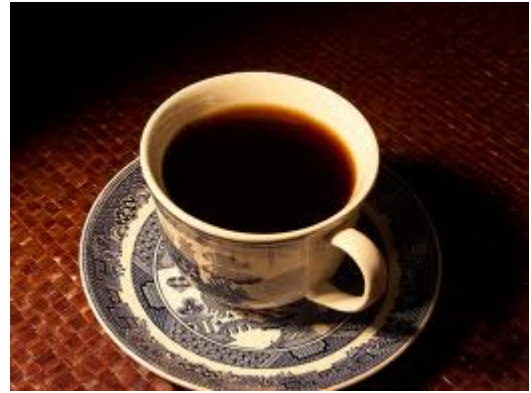
Figure 2.3 A Cup of coffee

Alexa (2015:1) stated that how to make coffee